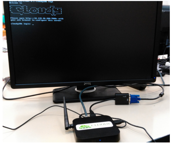
Fig. 3. Cloudy after installation on the Minix device.

Figure 4 shows the Cloudy Web GUI after login of the user. Typically, the user does all the configuration of the Cloudy community cloud node through the Web GUI.