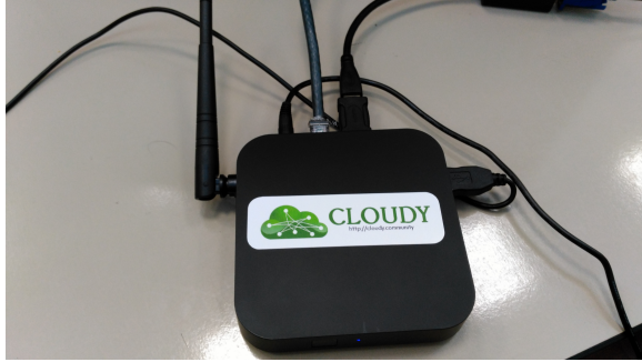
Fig. 1. Example of a community cloud node.

deployed in the Guifi community cloud. The device from Minix 1 comes with a low energy consuming Intel Z3735F (64-bit) processor, 2 GB of RAM and 32 GB of internal storage. Over the USB port, additional storage capacity can be added by the user.