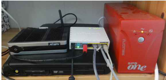
Fig. 2. Example of a community cloud node.

Figure 2 shows another community cloud node. A Jetway JBC362F36W with Intel Atom N2600 CPU, 2GB RAM and 64GB USB is used as node for the community cloud. Here, an additional UPS keeps the node running in case of power failures.